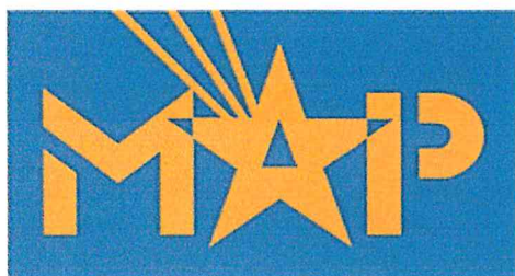
MILITARY ASSISTANCE PROGRAM