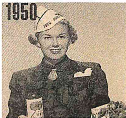
Doris Day Hollywood "Buddy" Poppy.

Welcome to all the "Buddy" Poppy Chairman this year. We are going to have a wonderful year. Working together promoting the "Buddy" Poppy. Helping our Veterans by using them. We all need to report every "Buddy" Poppy you use. If you do table display report is and tell me how many uses not a bunch. If you make a table display like this yes count how many on each jar and total. I would like to all your hard work, you can post then on # "Buddy" Poppy/National Home-Michigan. on Facebook. Our Theme. (Our Veterans the Angels Among Us). You can have a fund raiser by counting how many "Buddy" Poppies in a Larg Jar. Let's have fun with this year. This wonderful flower puts a smile on peoples faces. We need to share them. Our theme this year is "Our Veterans the Angels Among Us".